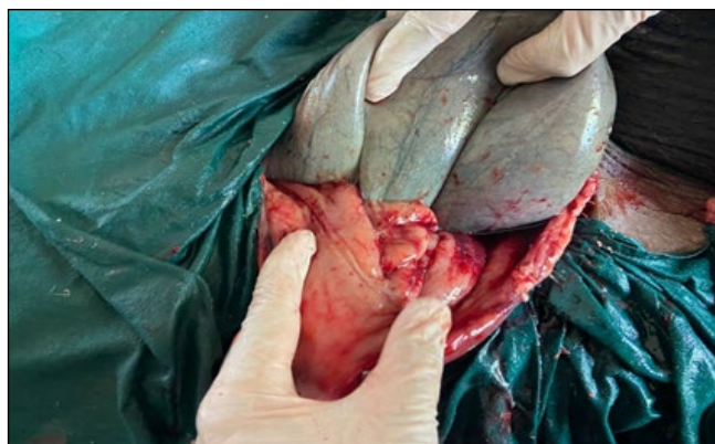
Figure 2b: Localized, flimsy-type uterine adhesions