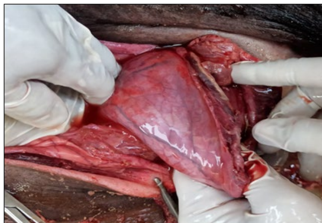
Figure 2c: Widespread dense-type uterine adhesions