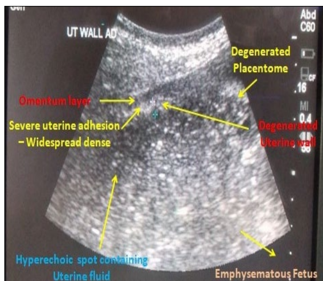
Figure 1c: Absence of fluid between the uterine wall and omentum