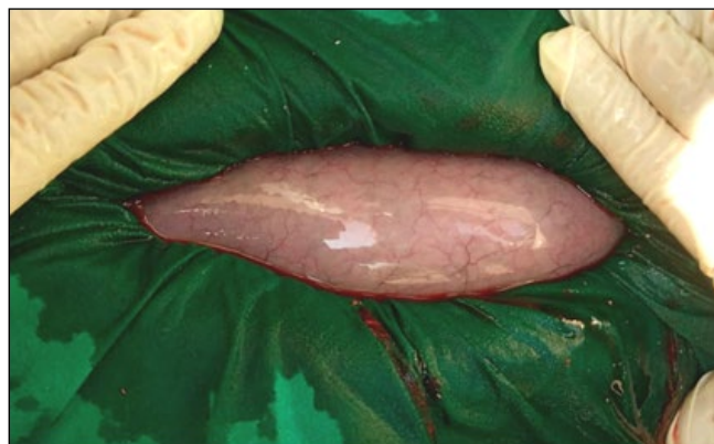
Figure 2a: Uterine non-adhesion

The caesarean section was performed on 44 buffaloes who suffered from non-reducible uterine torsion as per the method described by Roberts (1971). During the caesarean section, the uterine wall and other visceral organs were grossly examined for the presence or absence of uterine adhesion besides its extensiveness and severity. Out of 44 buffaloes, 32 buffaloes suffered from uterine adhesion, while 12 buffaloes without uterine adhesions (Figure 2a). The extensiveness of uterine adhesions (n=32) was noted and categorized as localized (flimsy or dense; Figure 2b), and widespread (flimsy or dense; Figure 2c) as per described by Fredericks et al. (1986) and Chauhan (2018).