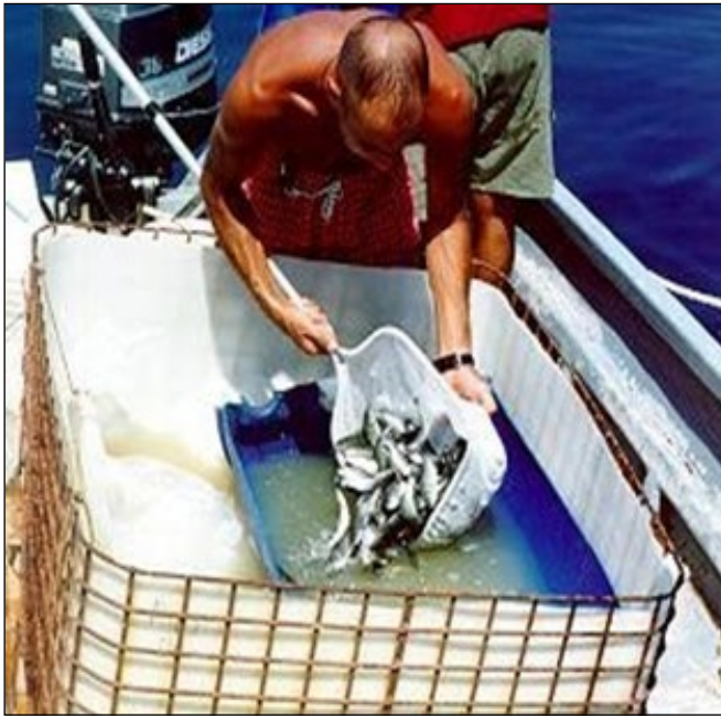
Figure 1: Immersion vaccination

Of the two alternatives, dip vaccination is more widely used