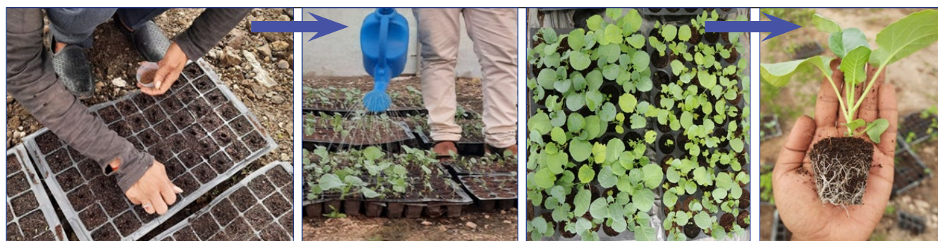
Plate 1: Raising of seedling of broccoli

seedling is prime requirement for vegetable cultivation and failure of seedling creates uncertainty of vegetable cultivation. Plug tray nursery grown technique provides actual number of seedling and reduce chance of failure.